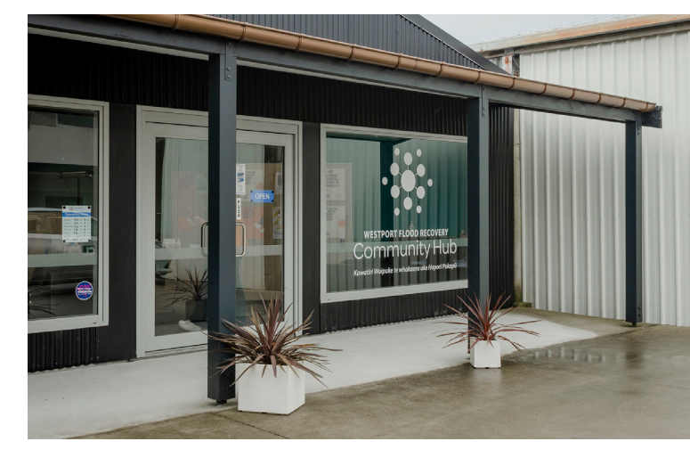
The Community Hub on Palmerston Street, Westport.

It is vital to seek qualified independent advice if you are offered a payout. Contact the Community Hub who will be able to put you in touch with Residential Advisory Service (RAS).