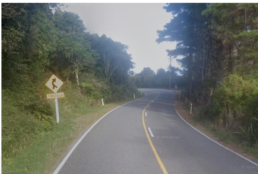
Photograph 1: State Highway 6 Looking South Towards Site Access