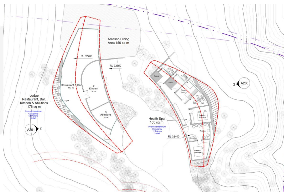
Figure 3: Layout of Restaurant and Health Spa (Extract from Ground Up Studio Drawing)