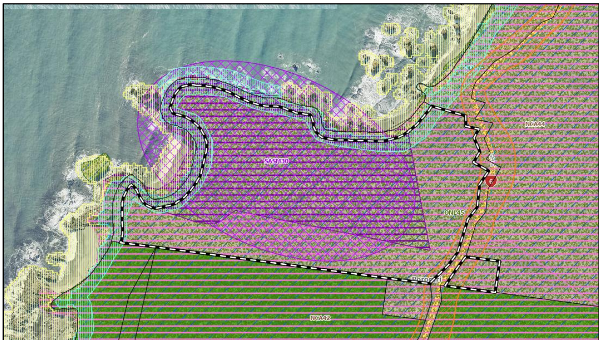
Figure 1 TTPP Planning Maps GIS