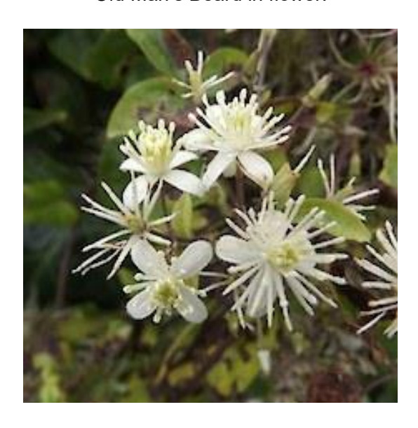
Old Man's Flower Seed: