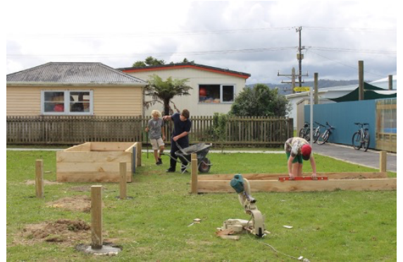
KAS students building raised garden beds

St Canice's School – getting to know the ngahere on the Millenium Track, with support from DOC.