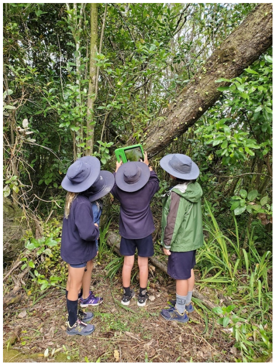
St Canice's students exploring plants and insects of the Millennium Track