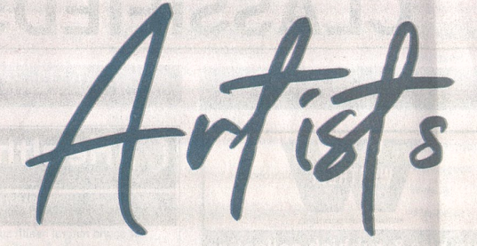
Epen Studios INANGAHUA DISTRICT