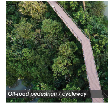
Off-road pedestrian / cycleway