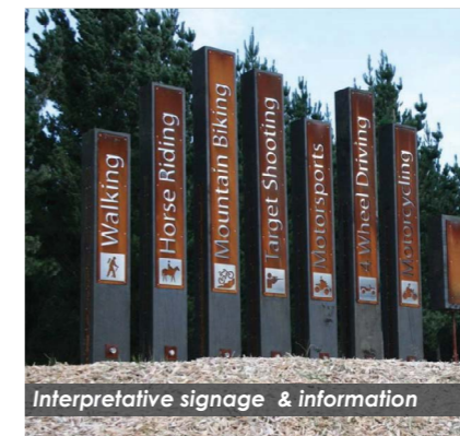
Interpretative signage & information