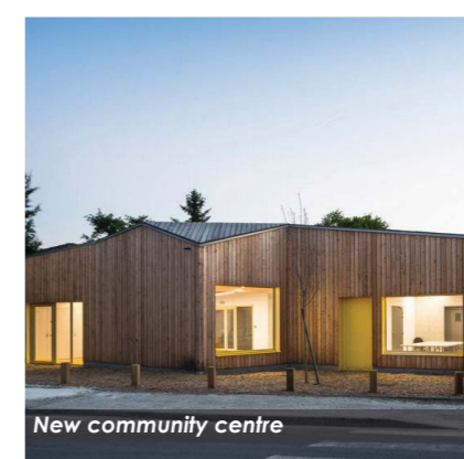
New community centre